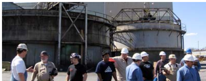
Over looking tailings. In the background are the lead and zinc concentrates thickeners.