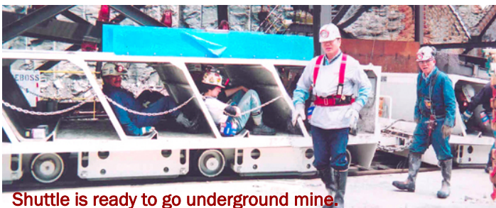
Shuttle is ready to go underground mine.