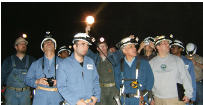
At Buick Underground Mine, observing roof and rib scaling operation in very large stopes.