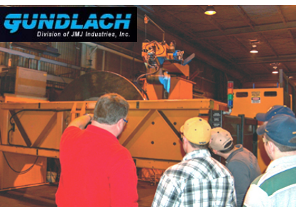
Observing the robotic welding operation

Our hosts spent their valuable time to show the group the entire manufacturing operation at the facility and to answer questions. The Department of Mining Engineering at West Virginia University would like to