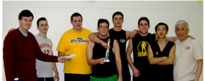
CEMR Engineering Week Basketball Game Competition: MinE team won 2nd Place.

The Department anticipates a total of 19-22 new students, including 12 new freshman recruited from high schools, and seven students from freshman general engineering class, and transfer. Additionally two students from Civil Engineering (CE) have declared for double major in Civil Engineering and Mining Engineering.