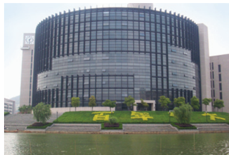
The new library at CUMT.

time of day, the pace of Xuzhou varied,” said Ellis. “Sometimes we would venture out during the day to grab some lunch and it seemed sort of