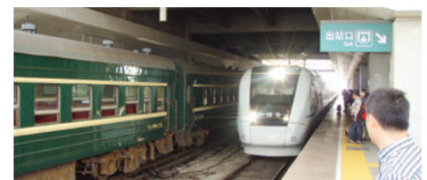
The Xuzhou arrival of the train to Beijing.

Numerous opportunities were scheduled for the group to meet with CUMT student groups. This was a good opportunity for our students to meet people of their own age and get a glimpse into Chinese culture and life at CUMT. Our students kept in contact with their Chinese counterparts