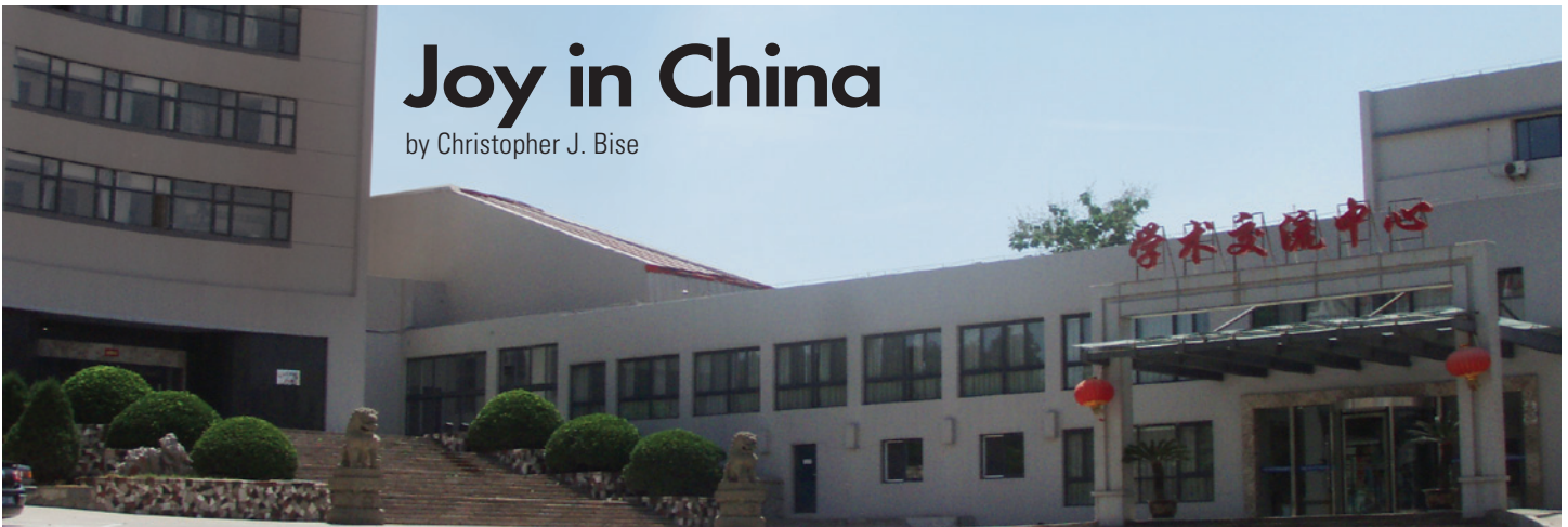
The hotel on the CUMT campus.