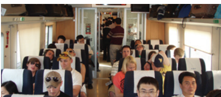
The interior of the train to Beijing.

Our last days in China were spent in Beijing. We boarded the bullet train from Xuzhou to Beijing for the five-hour trip. Although the train is not the fastest in the country (approximately 300 mph), the train hit 150 miles per hour for stretches at a time, similar to an Amtrak Acela in the states. The interior of the train was crowded, but still comfortable.