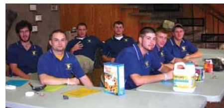
SME chapter members at the 17th annual Gem, Mineral, and Fossil Show at Mont Chateau in September.

They also use mineral samples, such as coal, limestone, pyrite, and trona, to demonstrate the sources of those products and the important roles that miners and mineral processing engineers play in producing those products. Each child who attended received a mineral kit that with samples of ten different minerals and other educational materials.