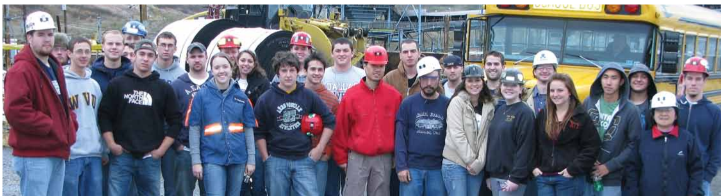
WVU mining engineering students toured CONSOL Energy's coal preparation plant and surface facilities at the Robinson Run Mine.

belts convey the coal downhill. The conveyors are each equipped with a disc brake at the drive and tail pulleys and belt turnovers on the return belt. The Robinson Run mine produced 6.5 million tons of bituminous coal in 2007. The coal is supplied to Allegheny Power's Harrison Power Station which is ten miles from the plant. Many thanks to CONSOL Energy for the tour.