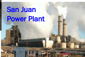
San Juan Power Plant

Mine was awarded a project to design and recommend roof bolting plans for the Vermilion Grove Portal, Black Beauty Coal Co. (BBC), Ridge farm, IL. The project team visited the Portal as a follow-up to study the results of the trials of various recommended roof bolting plans on April 12, 2004.