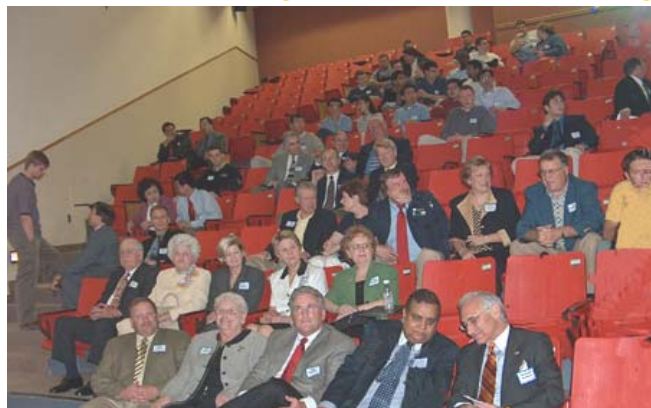
A View of the Ben's lecture attendants including, Alumni, Students, Faculty and Friends, in the Auditorium.

back into production. This recent fire mitigation, along with the other trials and triumphs in Ben's life serves as a perfect example of his closing remarks to the students: "You won't reach your goal – or your vision – without hurdles. But with patience, perseverance and focus ... you'll have the best shot. Never give up."